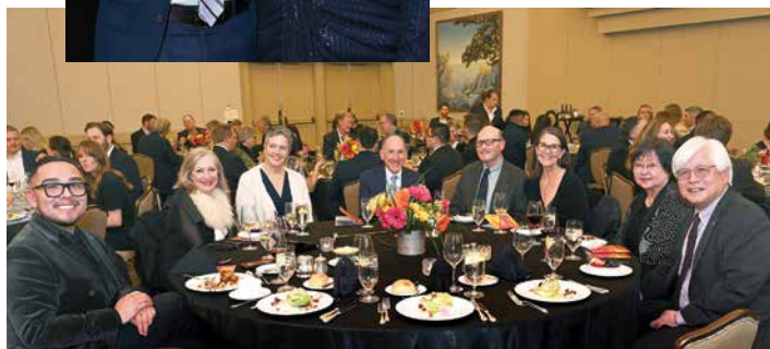
CFMC Board members and guests enjoyed the MCBC COVID-19 Survival Awards

challenge with an equitable approach, allowing space for different voices. This strengthened the VIDA Community Health Worker (CHW) Program, a powerful initiative of community-based organizations with trusted messengers that genuinely understand their communities. The CFMC continues to manage the VIDA program in partnership with the Monterey County Health Department.