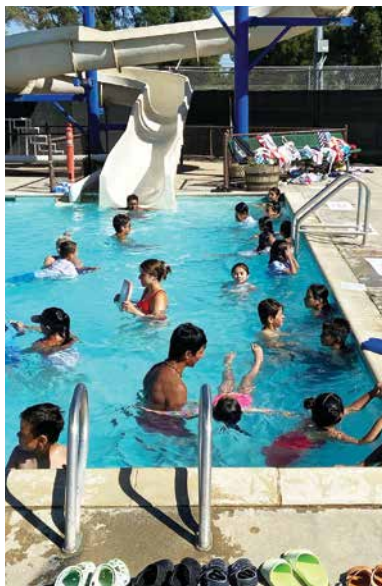
An SMCF grant to City of King Recreation Department provides free swimming lessons

In its most recent round of grantmaking, the Southern Monterey County Foundation (SMCF) granted $23,815 to 14 organizations serving King City and points south. The SMCF, an affiliate fund of the CFMC, has granted $192,000 since 2014 to projects and programs benefiting Southern Monterey County communities.