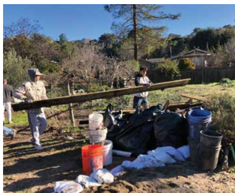
CFCV grants helped residents recover from storm damage

The Community Fund for Carmel Valley (CFCV) is a way for residents to come together to help their neighbors. In 2022, the fund granted $22,500 to eight local nonprofits to support a variety of programs, from