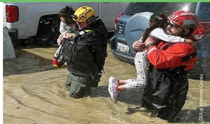
Hundreds of people were evacuated after the Pajaro levee breach

The impact of the flood on the Pajaro community will be felt for months and years to come. (continued on page 8)