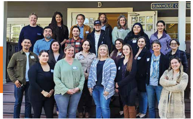
LEAD Institute 2023 gathered in February at Harden Foundation

Nonprofit organizations like Interim, Inc., which provides services and affordable housing in support of community members with mental illness, have tapped into this professional development resource for 11 of its staff over the years, strengthening its internal pipeline for growth. Youth Arts