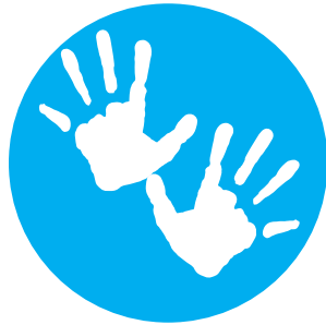
Children & Youth Development