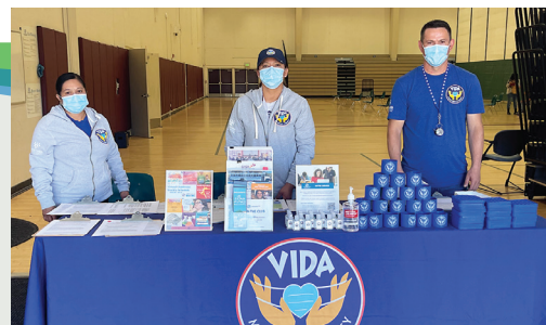
VIDA Community Health Workers help staff mobile vaccine clinics

VIDA continues to operate under the belief that, "My family is not healthy unless yours is." The pandemic has continued to reinforce how connected we truly are. The VIDA program has been a community effort, with funding from Monterey County, the CFMC and other entities. Monterey County has helped VIDA grow and develop into a community support infrastructure that has saved lives. Learn more: cfmco.org/VIDA .