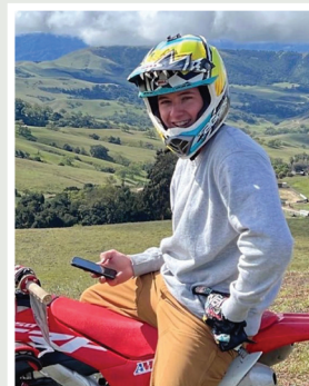
The #liveforross fund was created in memory of Ross Tarp-Braasch