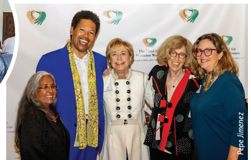
Above: Creating Your Legacy luncheon; Right: Fund for Homeless Women 10th Anniversary celebration

In addition to receptions for affiliate funds, additional events included the Siembra Latinos Fund 5th Anniversary (see page 3), a professional advisor luncheon and the events below.