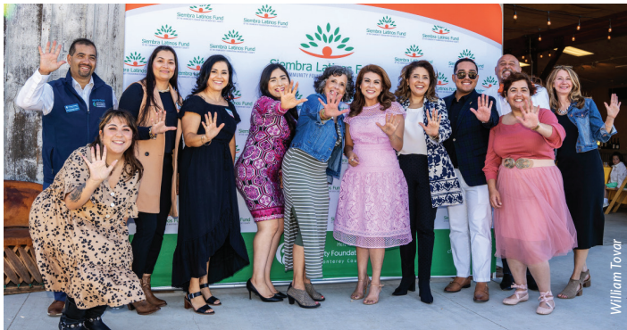
Siembra Latinos Fund Advisory Board members and CFMC staff at the 5th Anniversary Celebration

The Siembra Latinos Fund recently celebrated five years of inspiring giving by and for Latinos. The fund has granted more than $80,000 to nonprofit organizations and causes to uplift the Latino community. Gifts to the fund help create meaningful opportunities now and in the future.