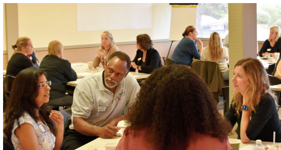
Local nonprofit executive directors gather to connect and recharge at a recent Breakfast Roundtable

A key focus for 2022 is investing in leadership through Executive Director Roundtables, a Guide to Leadership Transitions and the LEAD (Leadership, Education and Development) Institute. For more information, visit cfmco.org/CNE .