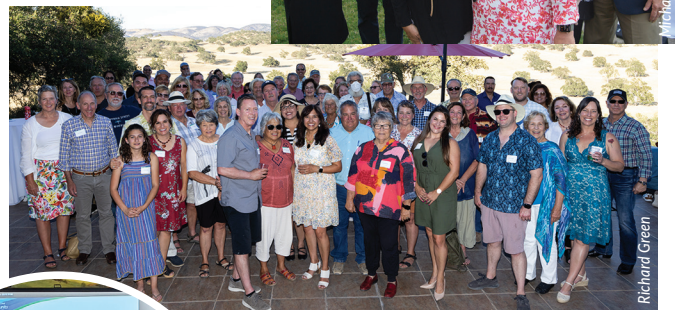
Southern Monterey County Foundation event