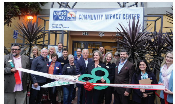
A CFMC CII loan supported the United Way Community Impact Center campaign

The CFMC allocates a small percentage of its investment portfolio to make local placements that will create local impact. In its first phase, this took the form of loans to Community Development Finance Institutions (CDFIs) who then reloan the funds to small businesses that would have trouble obtaining traditional financing. California FarmLink, Accion Opportunity Fund, and the Mission Economic Development Agency (MEDA) on behalf of the El Pajaro Community Development Corporation all received loan capital from the CFMC that they then