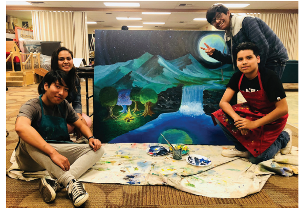
Students artists from Hijos del Sol

Hijos del Sol, a small community-based arts organization serving youth in East Salinas, received $10,000 for its Migrant Education Program. The funds will support its year-round after-school and school break workshops for 300 children, which offer free arts instruction, materials and studio space at the Migrant Education Center on the campus of Sherwood Elementary School in East Salinas. Ten young adults will also have the opportunity to apprentice and assist with exhibits and murals.