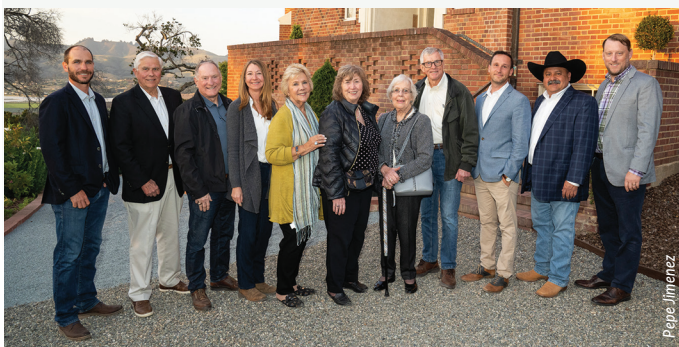
Northern Monterey County Foundation Advisory board members and CFMC staff