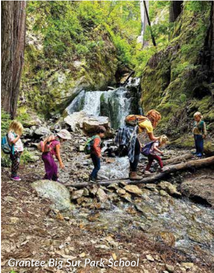
Grantee Big Sur Park School