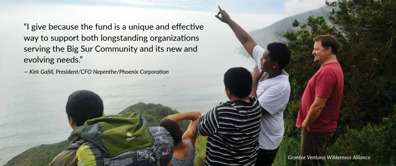
Grantee Ventana Wilderness Alliance