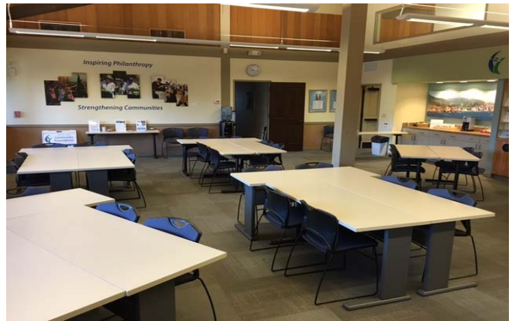
30 seats 5 Pods of 6 People Per Pod