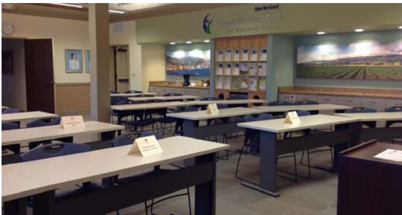
36 seats Classroom Style