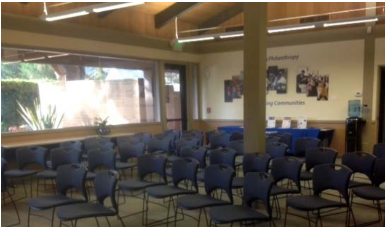
40 seats Theater Style

Guests must wipe down all tables and surfaces used at the conclusion of all meetings/gatherings. Wipes will be provided by CFMC.