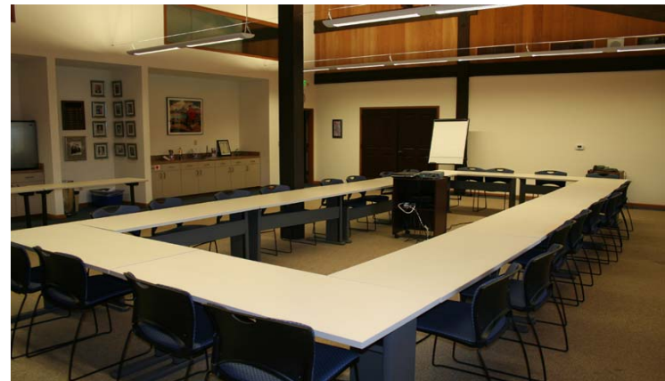
24 seats Board Room Style