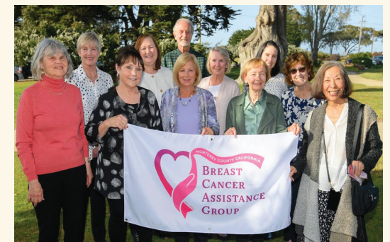
Breast Cancer Assistance Group of Monterey received a CFCV grant for special needs assistance

The CFCV increases the power of our gifts by giving us a sense of community and a broader horizon to find the areas in which to give.