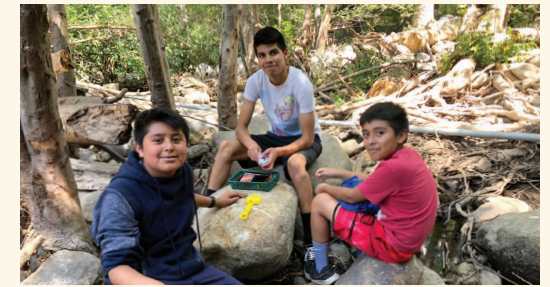
A CFCV grant supported the Friends of Cachagua Children's Center summer camp

We have created a way for caring neighbors to come together to grow a fund to thoughtfully address local needs.