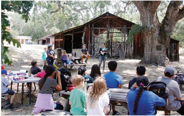
CFCV grantee UC Berkeley Hastings Reserve provides environmental education in Cachagua