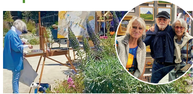
CFCV grantee Carmel Valley Art Association relocated and expanded their website

Thanks to generous community support, more than $200,000 was granted in the first two years of the fund to strengthen Carmel Valley.