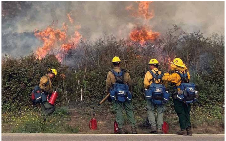
Los Padres National Forest

To repair firebreak the damage on Anastasia Canyon property