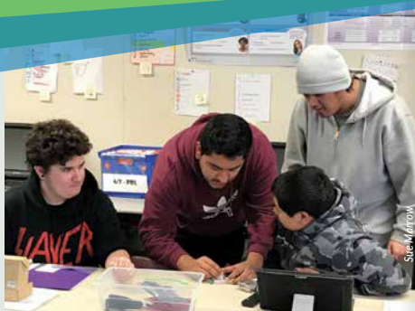
SMCF grant to Portola Butler High School gave students robot kits for STEM education