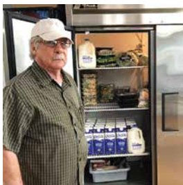
COVID-19 Relief grant helps meet demand at Veteran's Transition Center food pantry

We've seen a remarkable response, as CFMC fund holders, private foundations, corporations, service clubs and individuals have contributed to the COVID-19 Relief Fund.