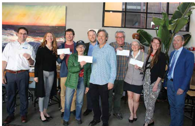
Monterey County Gives! check presentation reception