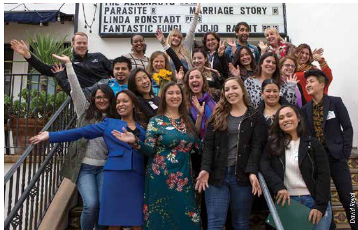
The 2019 Lead participants celebrate their graduation at the Osio Theatre