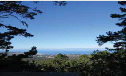
In its early days, the foundation helped preserve Jacks Peak and other open spaces

The 32 visionary men and women who met in the Old Custom House on a Monday afternoon to establish “a responsible agency through which public spirited benefactors may contribute to funds” created a