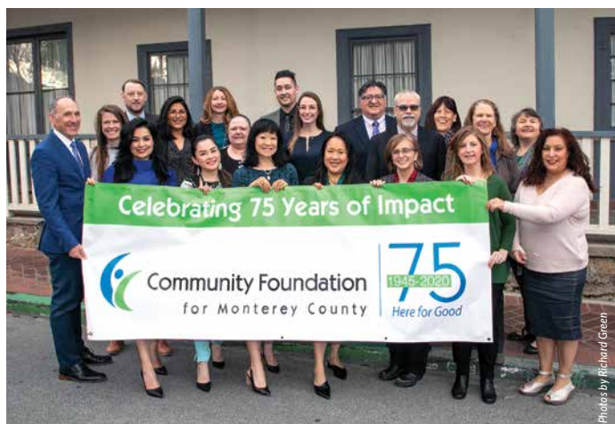
CFMC staff at Casa Abrego, one of the historic adobes the foundation helped save in the 1950s