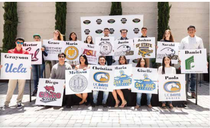
The Taylor Farms Scholarship Fund awarded $100,000 in scholarships in 2018 to 20 students who are children of Taylor Farms employees

awarded 125 scholarships totaling $420,000 to students attending the college or university of their choice.