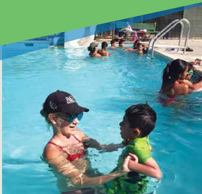
King City Recreation received a grant to provide free swimming lessons