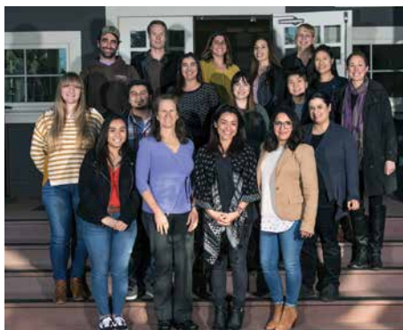
2019 LEAD participants meet monthly to grow in their leadership

The program is designed to maximize the leadership potential of capable nonprofit managers through monthly leadership and professional development seminars. Now in its ninth year, the program has served more than 130 nonprofit leaders. To see current participants or learn more, please visit www.cfmco.org/LEAD .