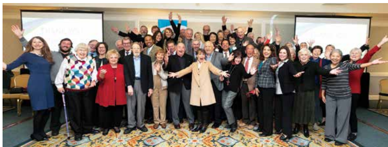
Guests at the 2019 CFMC Legacy Society Luncheon

More than 175 guests gathered at the annual Legacy Society Luncheon February 5, 2019 at the Monterey Plaza Hotel. The Legacy Society luncheon honors those who have made the important decision to include the CFMC in their estate plans. By partnering with the foundation, they trust the CFMC to ensure their wishes are carried out.