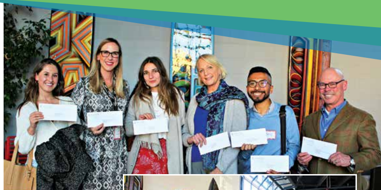
More than 150 organizations picked up their grant checks to fuel their "Big Ideas"

Now in its 10th year, MC Gives! has granted more than $22 million.