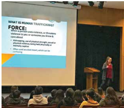
A grant from the Women's Fund brought Rising International's Safe & Sound program to Monterey County to educate students about human trafficking