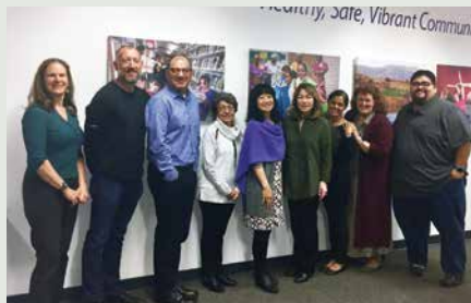
Irvine Salinas local advisory committee

The program is multi-year (2018-21), consisting of operating and program support grants, an organizational coach/mentor for each group and periodic convenings of the grantees for peer learning and training opportunities.