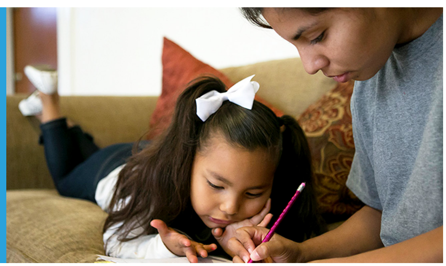
NMCF strengthens organizations like Pajaro Valley Shelter Services