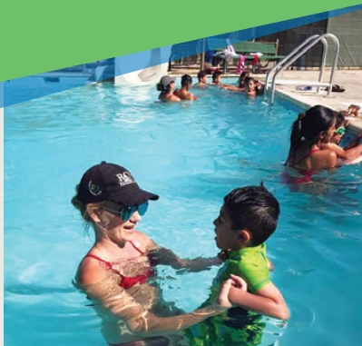
King City Recreation received a grant to provide free swimming lessons

In its fifth year of grantmaking, the Southern Monterey County Foundation (SMCF), an affiliate fund of the CMFC, granted $21,000 to 17 nonprofit organizations.