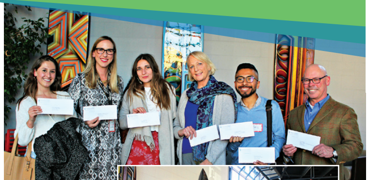
More than 150 organizations picked up their grant checks to fuel their "Big Ideas"

Now in its 10th year, MC Gives! has granted more than $22 million.