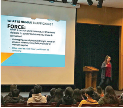
A grant from the Women's Fund brought Rising International's Safe & Sound program to Monterey County to educate students about human trafficking