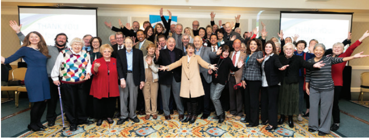
Guests at the 2019 CFMC Legacy Society Luncheon

More than 175 guests gathered at the annual Legacy Society Luncheon February 5, 2019 at the Monterey Plaza Hotel. The Legacy Society luncheon honors those who have made the important decision to include the CFMC in their estate plans. By partnering with the foundation, they trust the CFMC to ensure their wishes are carried out.