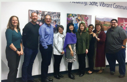
Irvine Salinas local advisory committee