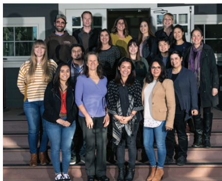
2019 LEAD participants meet monthly to grow in their leadership

The program is designed to maximize the leadership potential of capable nonprofit managers through monthly leadership and professional development seminars. Now in its ninth year, the program has served more than 130 nonprofit leaders. To see current participants or learn more, please visit www.cfmco.org/LEAD .