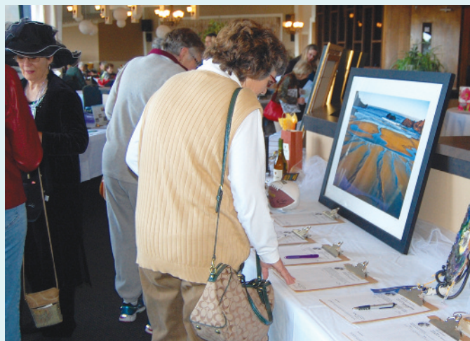
Brunch Auction Table