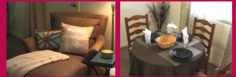
Fund for Homeless Women joined Community Homeless Solutions in the ribbon cutting ceremony for its new Women in Transition Shelter Program. The rooms (pictured above) were furnished and decorated by local volunteers from Sotheby's International Realty.