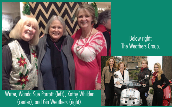
Below right: The Weathers Group.