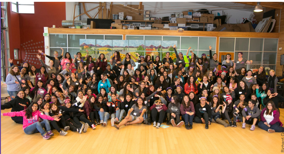
Girls' Health in Girls' Hands 2014 Fall Summit

An Initiative of the Women's Fund of the Community Foundation for Monterey County