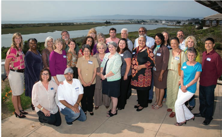
Nonprofit managers and board members from the six Monterey County grantees gathered at first CLP convening in Moss Landing

*The CLP is a collaboration between the CFMC, Community Foundation Santa Cruz County and the Community Foundation for San Benito County. The CLP is funded by The David and Lucile Packard Foundation, The James Irvine Foundation and The William and Flora Hewlett Foundation as part of their larger Community Leadership Project initiative to strengthen small nonprofit organizations serving low-income people and communities of color in the San Francisco Bay Area, San Joaquin Valley and the Central Coast.