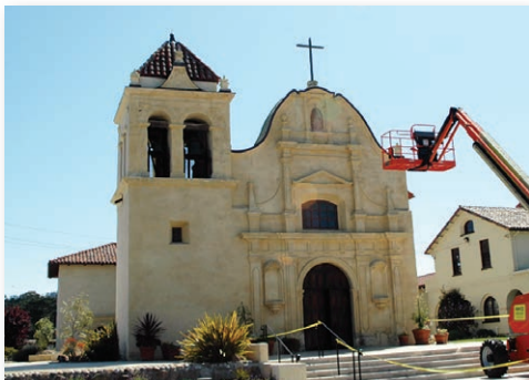
RPCF's new website will introduce preservation activities that underscore the historical significance of this local gem

Opportunity grant — $5,000 for website development