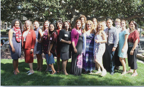
2012/2013 LEAD Cohort graduates

The fourth class of nonprofit “LEADers” graduated September 6, 2013 from the LEAD (Leadership Education and Development) Institute of the CFMC’s Center for Nonprofit Excellence. Seventeen nonprofit professionals from Monterey, San Benito and Santa Cruz counties gained significant new abilities and enhanced their capacity to provide