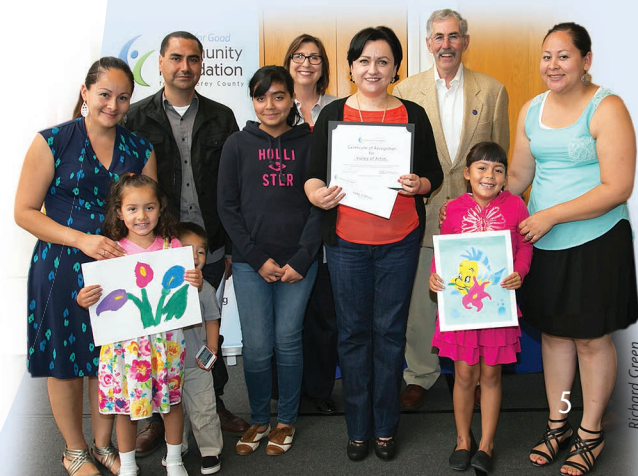
NGP grant recipients Valley of Artists (Greenfield)