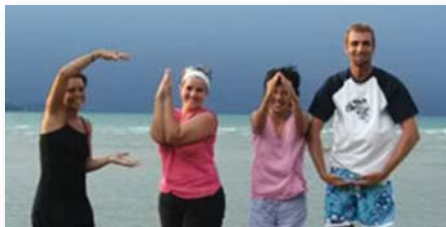
"Here for Good"