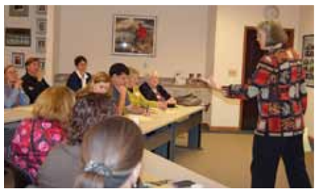
Communities Advancing the Arts (CAA) organizations participate in the Donor Development Institute.

As part of our commitment to providing the greatest possible community impact, we work with nonprofit organizations to strengthen their capacity to accomplish their missions. This spring marks the culmination of six years of work with local arts organizations through Communities Advancing the Arts (CAA), expanding their ability to reach more diverse audiences and donors and improve internal capacity to inspire support for arts and creativity.