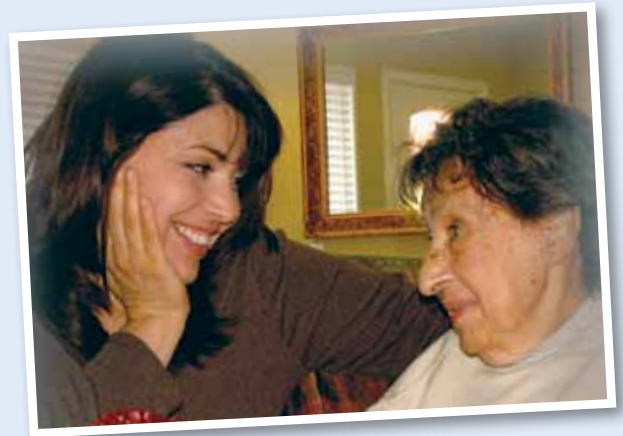
Del Mar Caregiver Resource Center provides support to people like this young woman who is caring for her grandmother

This General Endowment grant specifically supports the Del Mar Caregiver Resource Center in Salinas, one of several health-related projects of the Health Project Center (HPC). This program provides support annually to over 1,000 family caregivers of brain-impaired adults who may suffer memory loss, confusion and severe physical limitations. Services include respite care, family consultations to develop a care plan, legal consultations, individual counseling and stress management, and support groups with other caregivers. Eighty percent of all long-term care services in the U.S. are provided by family caregivers so support for them is critical to maintaining our long-term care system. While HPC has lost 72% of its government funding in the last year, it anticipates at least a 20% increase in request for services this year alone. This grant will help bridge that gap with increased private funding to maintain these critical family services.