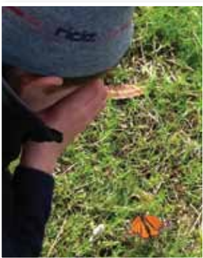
Young visitor studies monarch up close.