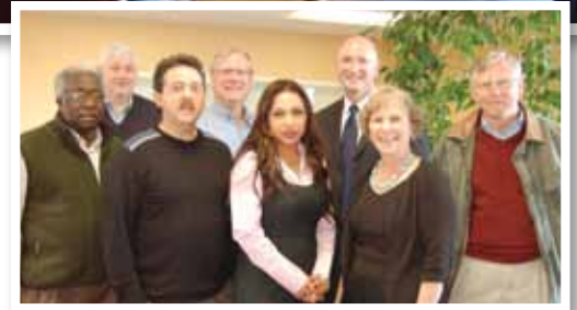
Top: The Grants and Program committee discusses priorities.