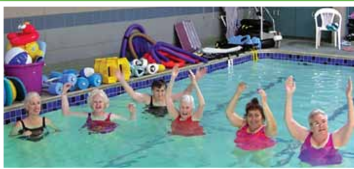
People of all ages and abilities enjoy the pool. All receive relief that only warm water exercise can provide. Shown here, arthritis aquatics.