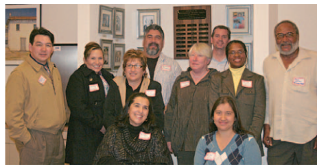
Community Leadership Project grantees attend January training

In September 2009, the Community Foundation for Monterey County inaugurated its new leadership development program, Leadership Education and Development (LEAD) . Over the course of a year, LEAD provides 20-25 capable nonprofit managers with the skills to assume organization-wide leadership roles. Participants represent