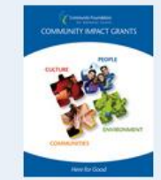
Community Impact Grants

Find Us On facebook www.facebook.com/cfmco